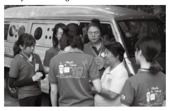
Picture: Students asking NGO representative questions about their "mobile health clinic" system reaching out to the street children<sup>5</sup>

During a briefing session from a local NGO, one student stated the following.