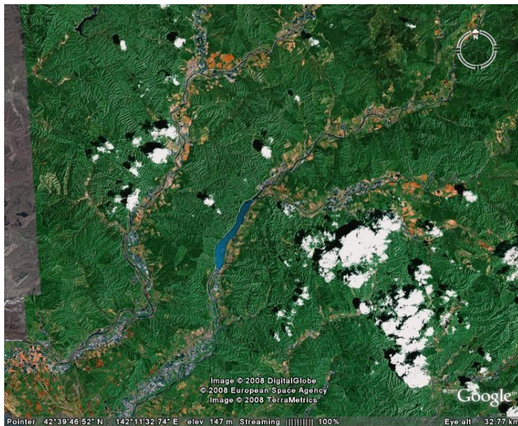
Map 2. Far off satellite image of how the dammed section of the Saru River resembles a large lake when compared to the thin Saru River south and north of the two dams.