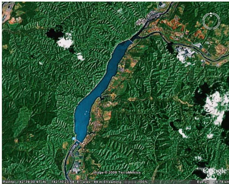
Map 1. Close view of the main Nabutani dam at the south end of the dammed section of the Saru River. At the north end is a smaller dam.