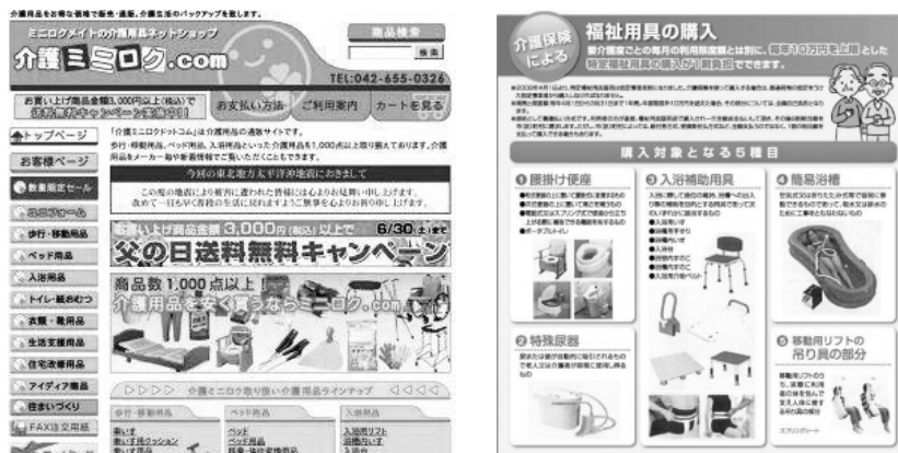
Fig.3: Silver Consumption in Ageing Society: New Market?