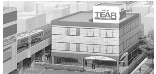
Figure 7: Funeral Home TEAR next to Railway Station

In Japan, to respect and high value someone's death is a norm with many sophisticated rituals – and the industrializing of funeral and its follow up faith-based activities. For its superb ontological appeal (for Asian belief that life can be in existence though in different form, “life after one's life” so to speak), Buddhist practice of rituals for one's death