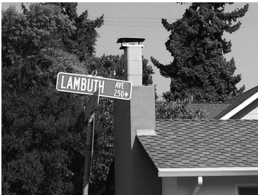
Lambuth Avenue sign in Oakdale, CA. Photo by author, 27 August 2016.

for them in China. In the photo of the sign for Lambuth Road, young almond trees can be seen in the new orchard behind.