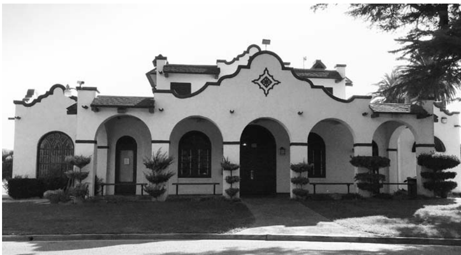
Park View Funeral Chapel, Manteca, CA.