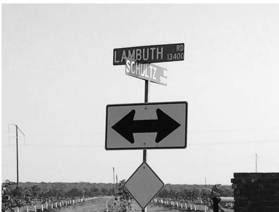
Lambuth Road sign with new almond orchard in background. Photo by author, 27 Aug. 2016.

for them in China. In the photo of the sign for Lambuth Road, young almond trees can be seen in the new orchard behind.